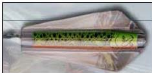
A Tasmanian Devil

If you're planning a visit to New Zealand and would like a go with Lake Rotorua's trout, get in touch with the Waiteti Lakeside Lodge. You can find their website at www.waitetilodge.co.nz .