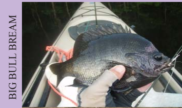
BIG BULL BREEM