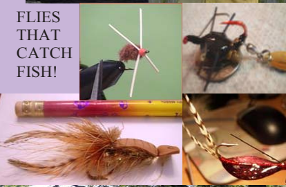
FLIES THAT CATCH FISH!