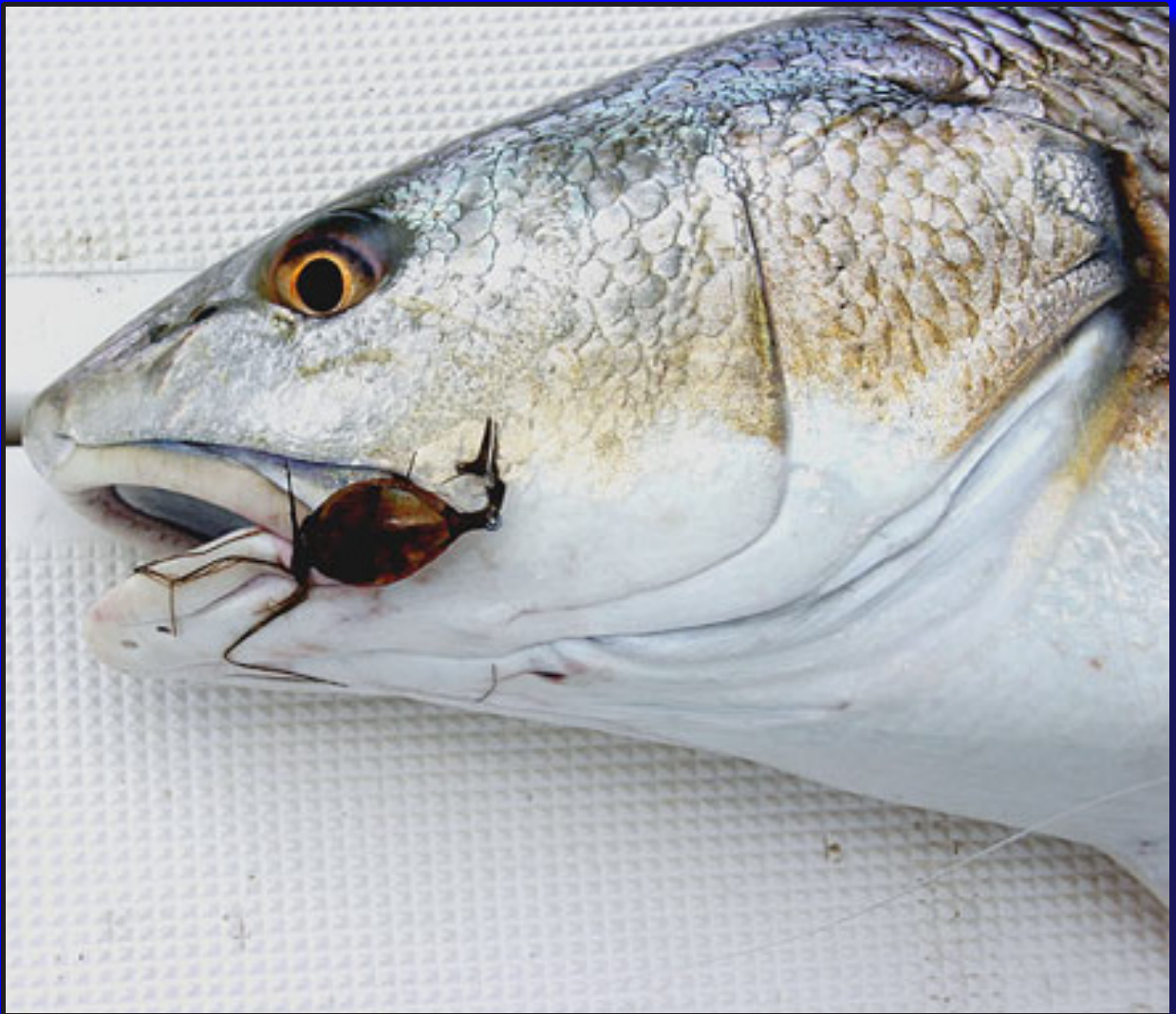
Redfish Brown Spoon