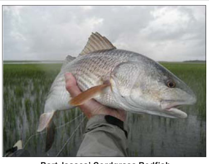
Bart Isaacs' Cordgrass Redfish

flats. Plus you have the advantage of stealth. Also having a kayak that you can stand up in and pole yourself is a major advantage for optimum visibility. I could recall being able to see tails probably more than 100 yards away!