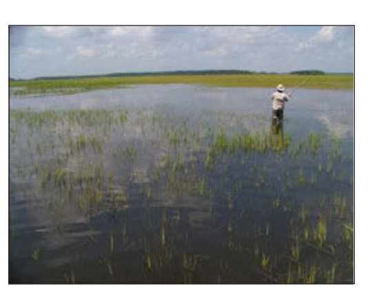
(continued on page 5)

to 35-foot cast works best for not spooking the fish and still have good a c c u r a c y. Presentation and accuracy really matter here, with minimal false casts.