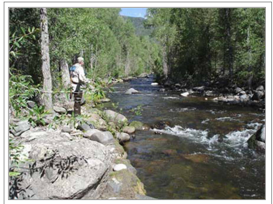
The Author Enjoys Fishing A Western Creek

I'd just returned from a satisfying morning of catching 8-10-inch cutthroats, feisty little fish that would slam into virtually any fly you tossed their way. There was the rather odd business of having to cast over your head to reach these fish, but stranger things have occurred on fishing trips. These particular Rocky Mountain natives called Cimarron