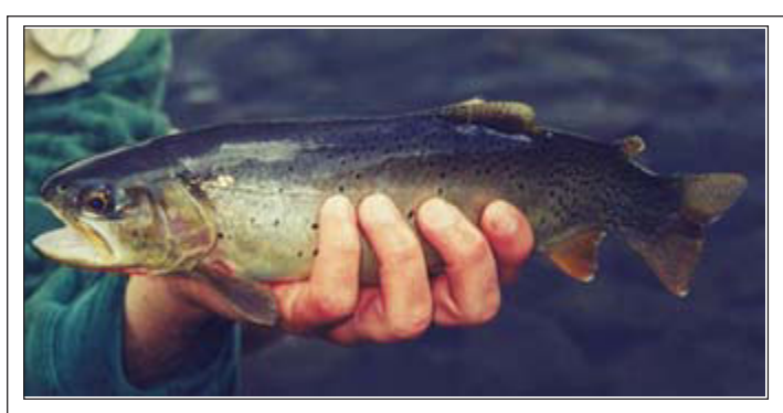
Distinctive Jaw Slash of A Rockies Cutthroat

strain, edging up on tiptoes to try and discern a strike. Unless you've really made a mess of your cast, the strike almost