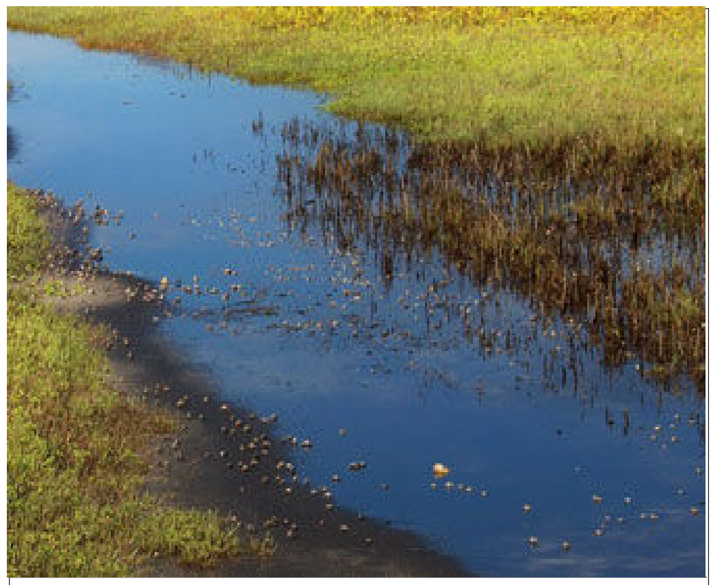
September 2007: Crabs in The Cordgrass by Rich Santos.