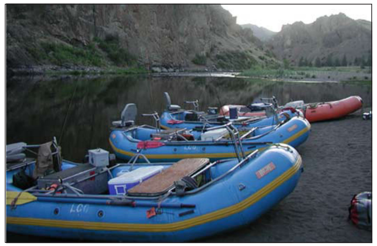
Guide Boats Along the John Day at Night Camp Shoal